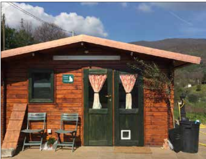
The building and land were generous donations for the PGC project

It has been a year and a half since Passione Gatti di Canepina (PGC) started to materialize from a dream of Rosemary Slattery, a volunteer at Cats Angels. A lot has happened in that short period of time. With gifts of land and a building to house the project, it has continued to grow. PGC now has a fully up and running Trap/Spay-Neuter/Release program in Canepina Italy. It is a registered Cat Colony within the province of Viterbo and typically has 2-4 cats neutered/spayed every month. More than fifty cats have been neutered and released back into the community as a result. An extensive vaccination program is also an integral part of the program at PGC and more than 70 cats have been vaccinated and dewormed.